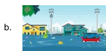
Rising sea levels and flooding