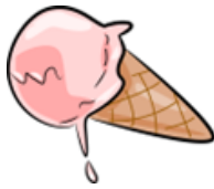
Ice cream melting on a hot day