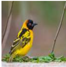
a) Weaver bird

The male bird makes beautifully woven nests. The female looks after all the nests and chooses the one that she likes the best and decides in which one to lay her eggs.